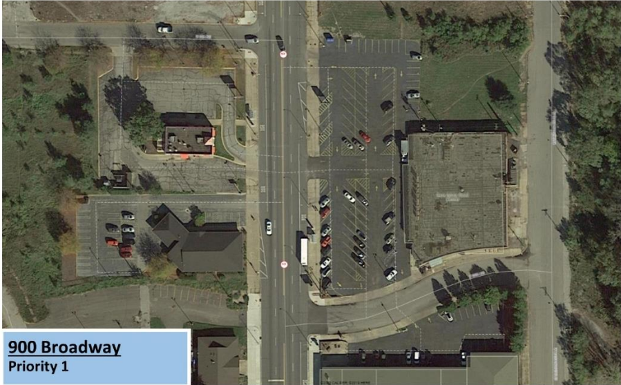
900 Broadway Priority 1