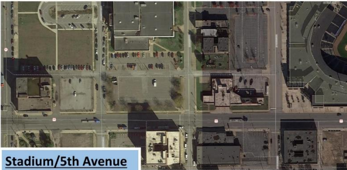
Stadium/5th Avenue Priority 3