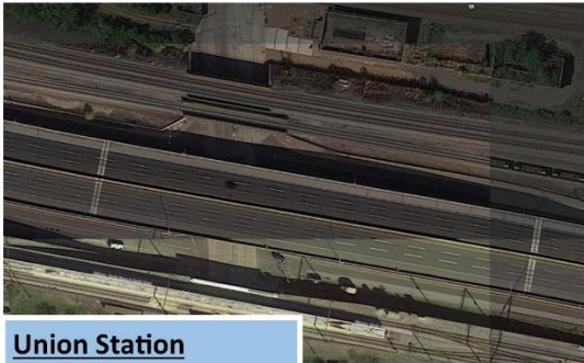
Union Station Priority 3